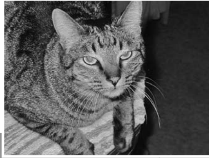
Denver, the store cat.

About the only exceptions to the vast assortment of goods available are alcohol, ammunition, and weapons, which are not allowed in Deadhorse. Typical groceries are not carried, since the residents of Prudhoe Bay/Deadhorse and the outlying oilfields reside in oilfield "camps" where regular meals are provided to the workers.